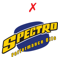
Do not change angle under any circumstance