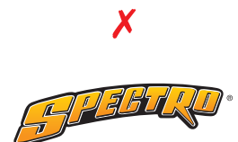
Do not use any older version of the logo, you can spot an old logo by it's pointy "R" or a yellow-orange gradient in "Spectro"