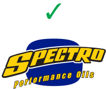
PREFERRED Primary Logo