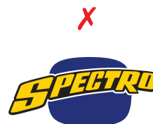
Do not omit ANY logo elements under any circumstance