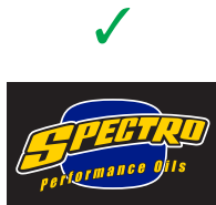
Full-color logo on black or dark background