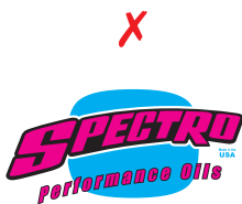
Do not change colors under any circumstance